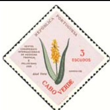
Cape Verde 303