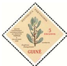
Portuguese Guinea 295