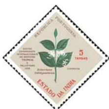
Portuguese India 569