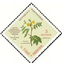
St. Thomas & Prince 371